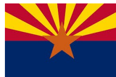
ARIZONA STATE FLAG

The Upcoming Agendas option allows you to find agendas for bills in upcoming committee meetings.